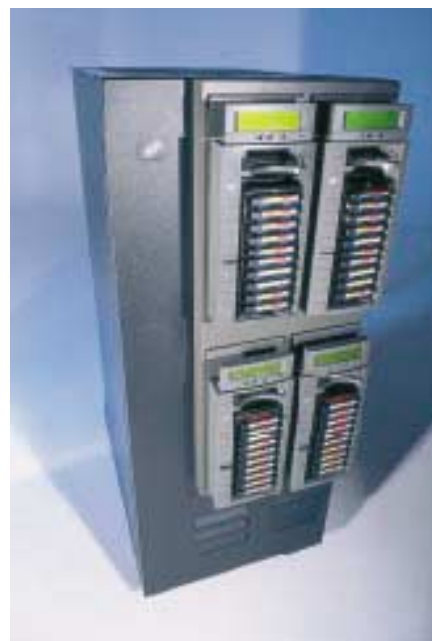
Magstar 3590 Tape Subsystem

1 Depending on data content; 2 Maximum of four weeks; 3 Maximum of ten days; 4 Maximum with no condensation; 5 Additional part numbers can be found at www.ibm.com/storage/media ; 6 Limited to defects in materials and manufacture at the time of purchase. Does not include wear from normal use or product misuse.